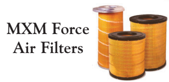
MXM Force Air Filters