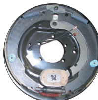
Electric Backing Plates