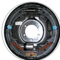
Hydraulic Backing Plates